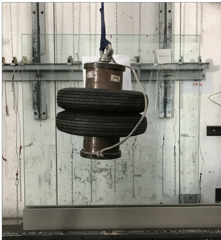
Photograph of the item after impact on the center of the glazing with dynamic load according to standard UNI EN 14019:2016