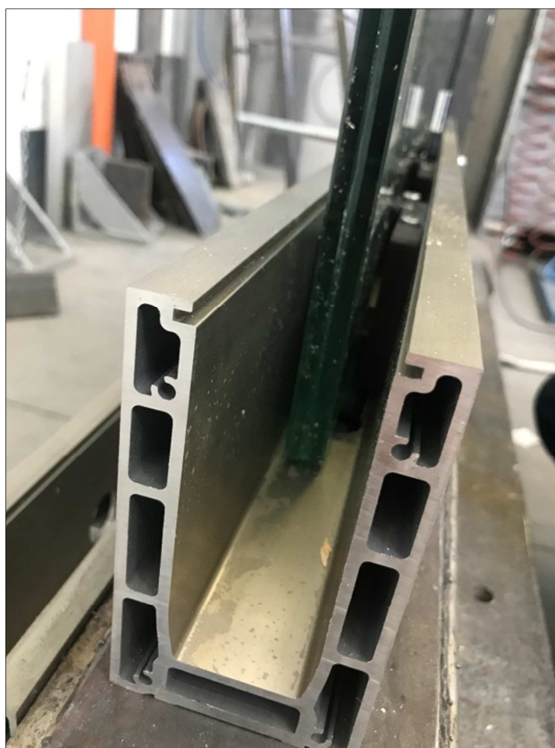
Photographs of the Item