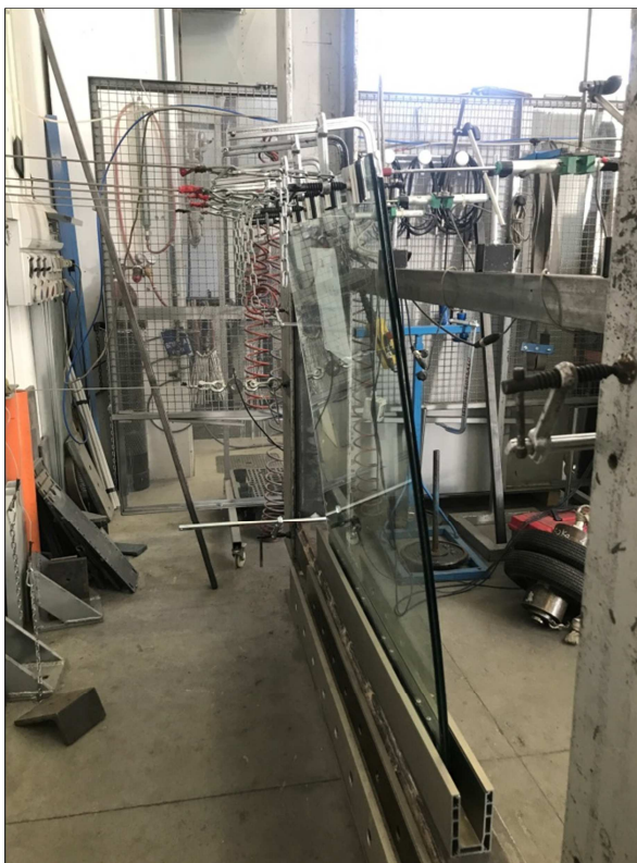
Photograph of the item undergoing horizontal linear static loading