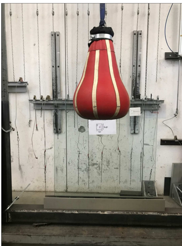
Photograph of the item after impact on the border of the glazing with dynamic load according to standard UNI 10807:1999