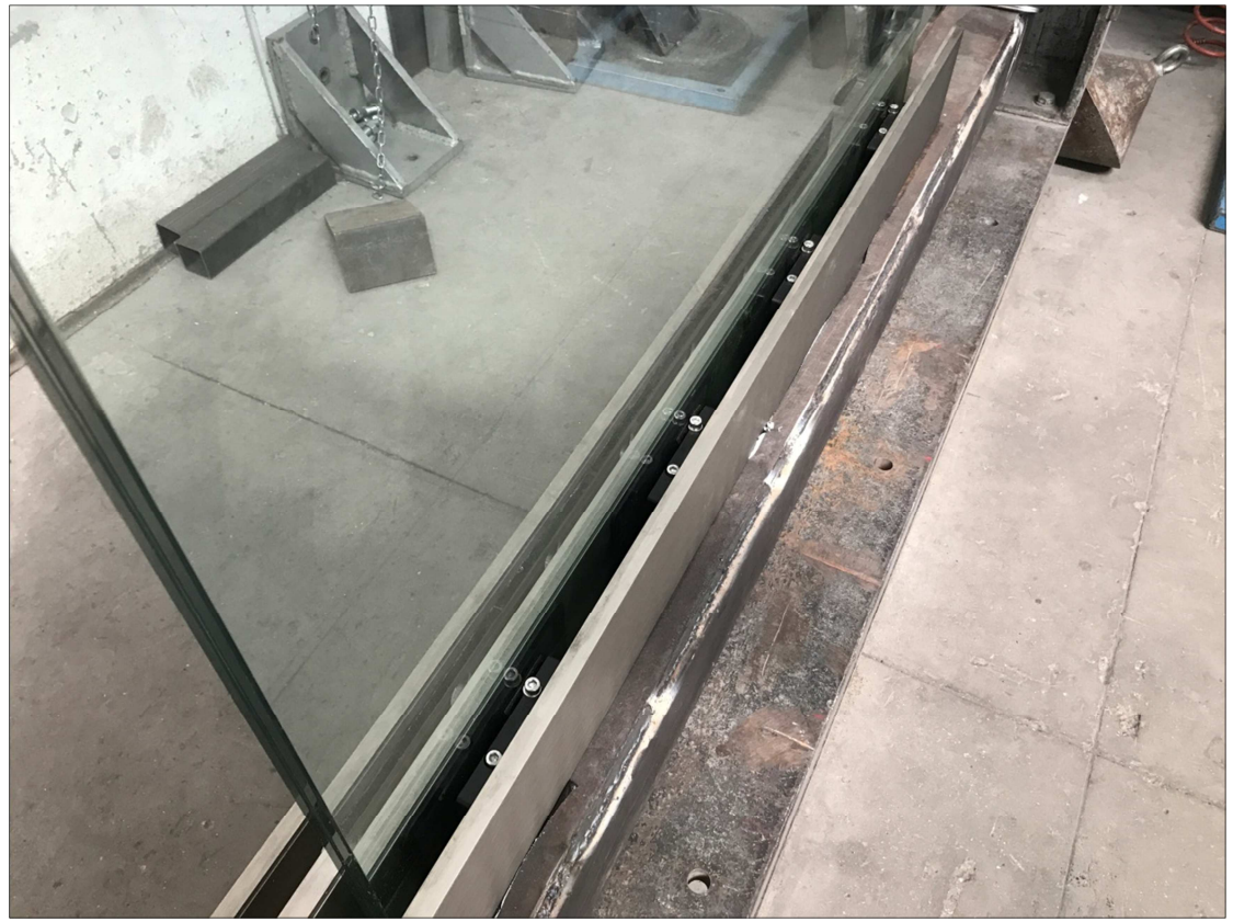
Photographs of the Item