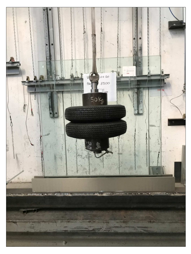
Photograph of the item after impact on the center of the glazing with dynamic load according to standard UNI EN 14019:2016