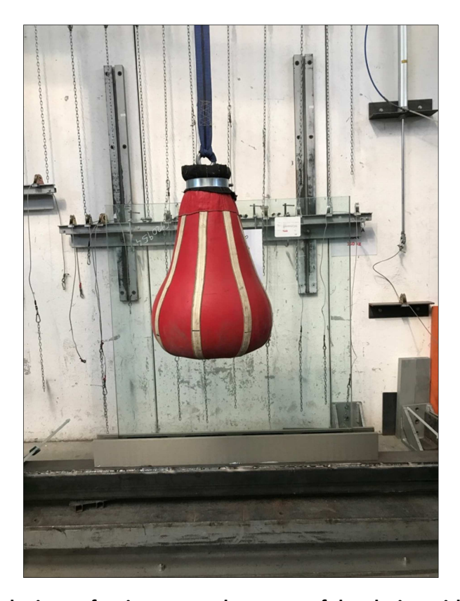
Photograph of the item after impact on the center of the glazing with dynamic load according to standard UNI 10807:1999