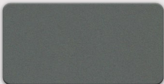
TX Alpine Grey