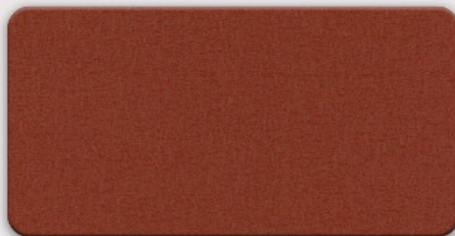
TX Ceramic Red