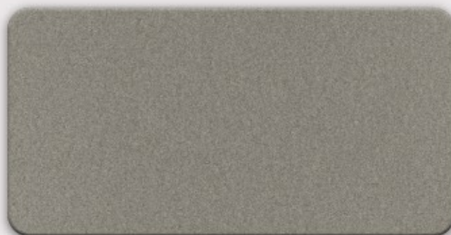
TX Metallic Grau