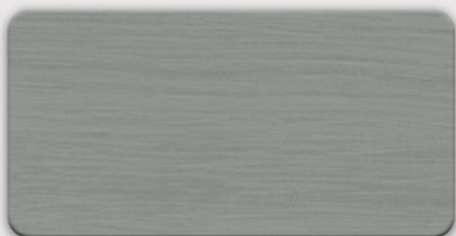
TX Velvet Zinc