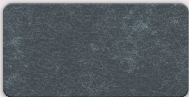
TX Velvet Grey