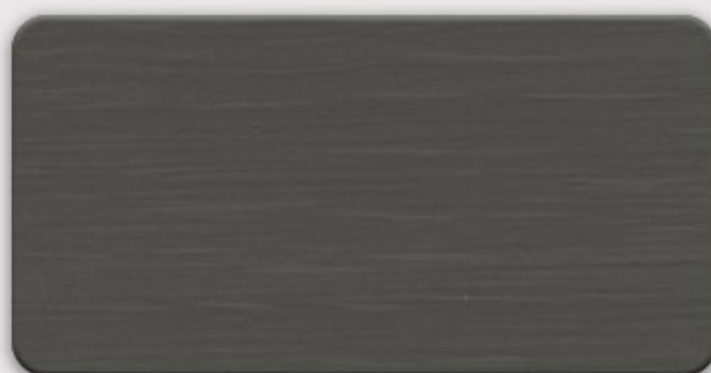
TX Velvet Basalt