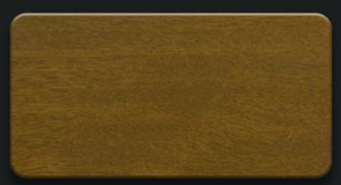
Golden Oak Light