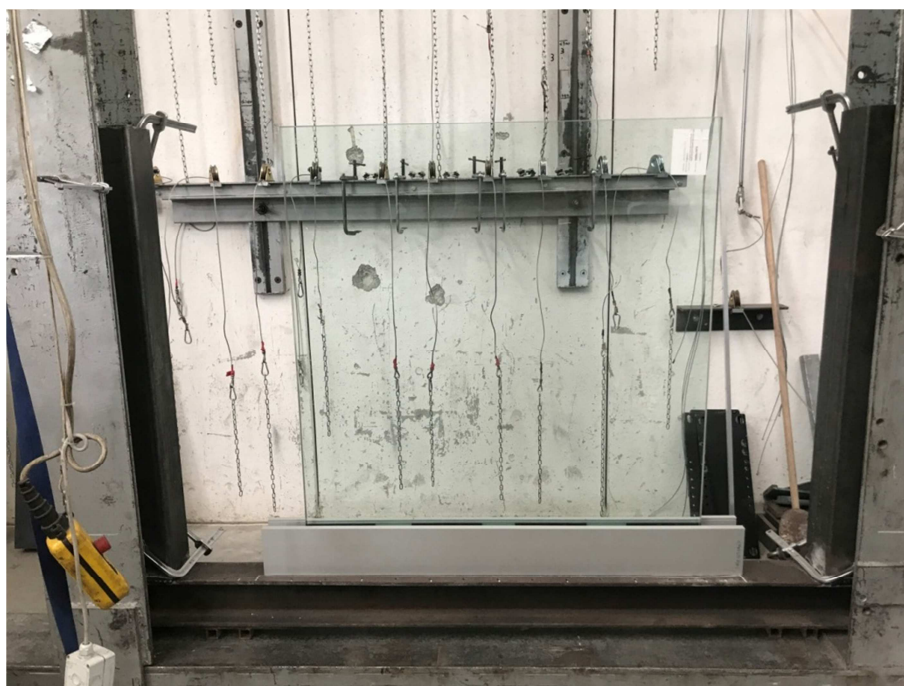
Photograph of the Item