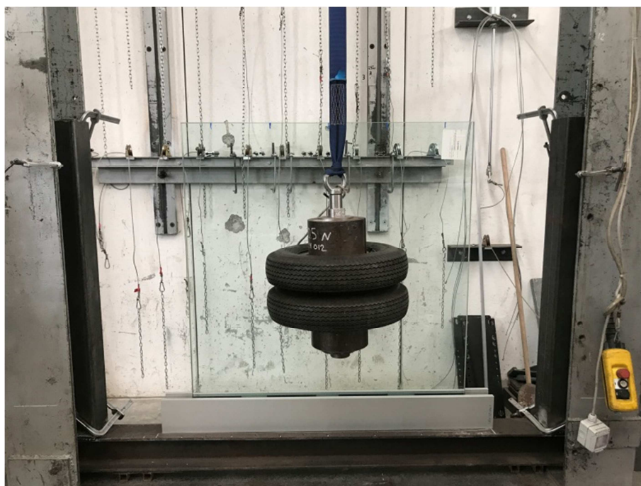
Photograph of the item after impact on the center of the glazing with dynamic load according to standard UNI EN 14019:2016