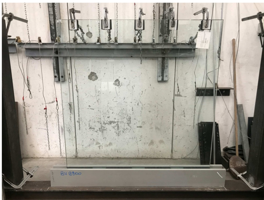
Photograph of the Item