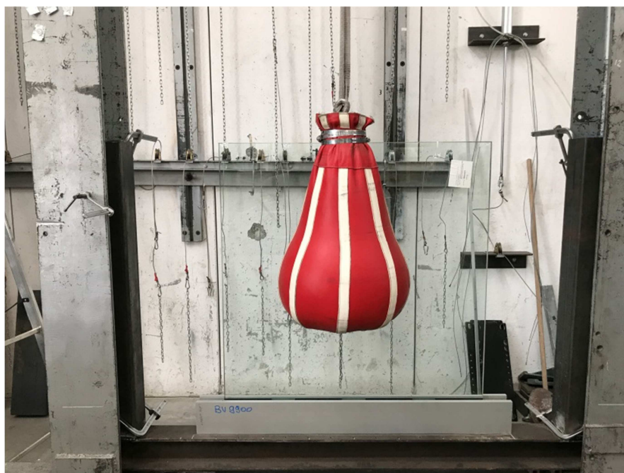
Photograph of the item after impact on the center of the glazing with dynamic load according to standard UNI 10807:1999