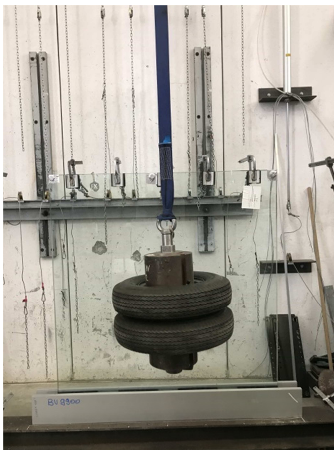
Photograph of the item after impact on the center of the glazing with dynamic load according to standard UNI EN 14019:2016