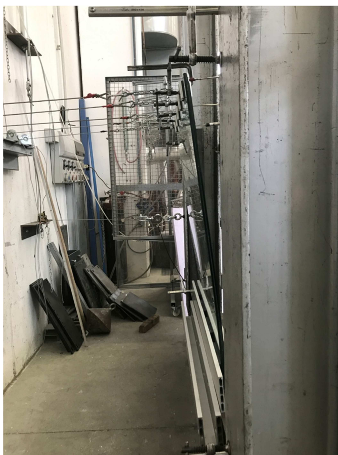
Photograph of the item undergoing horizontal linear static loading